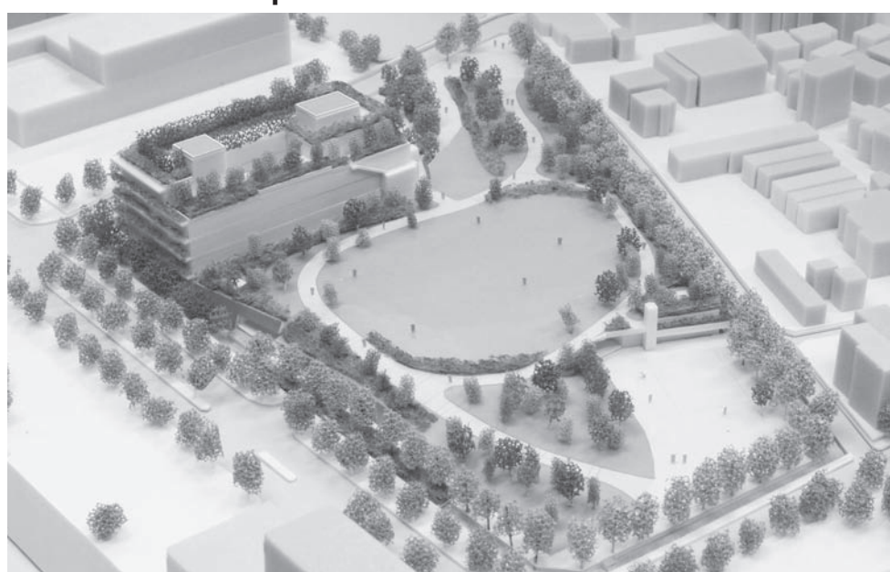
Image of the planned project for "the improvement of the area around Mitaka Civic Center" (This is an unfixed model created in the basic design phase)