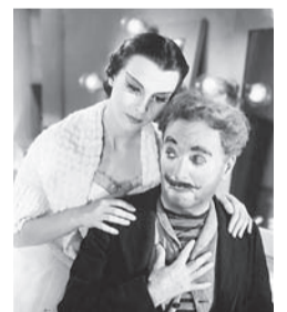
"Limelight" ©MCLMII Celebrated Films Corporation renewed ©MCLXXX Roy Export Company Establishment all rights reserved.