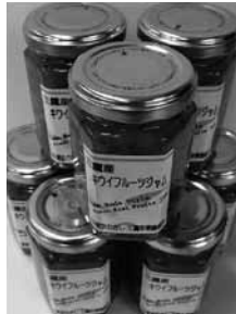
Kiwi Fruit Jam Produced in Mitaka