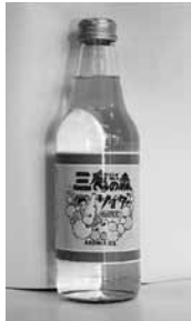
Mitaka-no Mori Cider