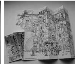
Original Dazai Map