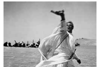
Lawrence of Arabia ©1962, renewed 1990, © 1988 Columbia Pictures Industries, Inc. All Rights Reserved.

The film depicts the life of British army officer Edward Lawrence, who risked his life in the Arab Revolt. One of the highlights is its portrayal of the harshness and beauty of the vast desert, which stretches across the big screen.