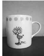
Poki Mug © 2001 Studio Ghibli