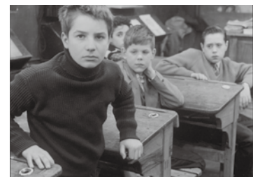
Les Quatre Cents Coups

Starring: Fanny Ardant, Jean-Louis Trintignant, and Philippe Laudenbach