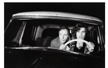
Vivement Dimanche! © 1983 Les Films du Carrosse