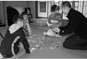
Playing with karuta cards

We will celebrate the New Year by dividing and eating the rice cake we made together at the end of last year ( kagami-biraki ) and enjoying performances of the shishi-mai lion dance and traditional iwai-bayashi music.