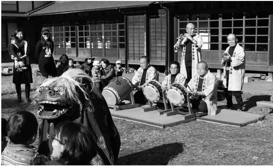
Shishi-mai lion dance and iwai-bayashi music