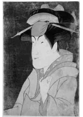
Tomisaburo Nakayama as Miyagino, Sharaku Toshusai, woodblock print large

Note: Free of charge for junior high school students and younger and for those with a Handbook for the Disabled.