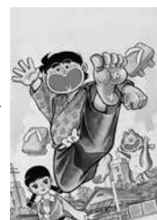
Inakappe Taisho Two-color chapter cover, Shogakukan's Shogaku Sannensei, 1970, February issue

Noboru Kawasaki is a manga artist known for works such as Kyojin no Hoshi (Star of the Giants) and Inakappe Taisho . The exhibit reflects on Kawasaki's approximately sixty-year art career, which has developed side-by-side with postwar manga history.