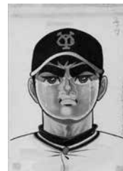
Kyojin no Hoshi (Star of the Giants) (Story written by Ikki Kajiwara) Color cover, Kodansha's Weekly Shonen Magazine, 1968, Vol. 24 © Ikki Kajiwara and Noboru Kawasaki, Kodansha