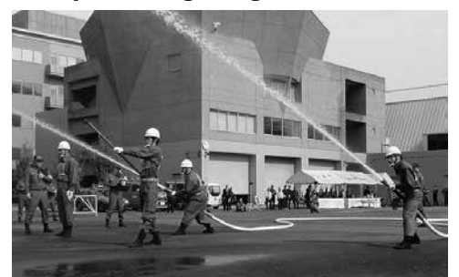
A demonstration of firefighting techniques by Corp 7, the winner of the previous event

This event is conducted every other year with the goal of improving the firefighting techniques of Mitaka City's volunteer fire corps. The competition includes giving accurate instructions and performing quick actions that are necessary while fighting fires, equipment maintenance, disciplined action and so on. Come see the corps members in action.