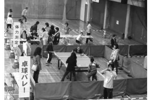
Scene from last year's festival (Dai-ichi Gymnasium)