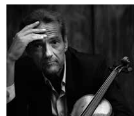
Giuliano Carmignola