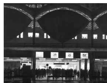
Ame, Furu (Rain Falling), 1990, iwa-enogu (mineral pigments) on kumohada hemp paper, 175 × 227 cm