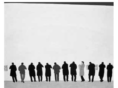
Phone, 1983, iwa-enogu (mineral pigments) on kumohada hemp paper, 130.3 × 162.1 cm, Mitaka City Gallery of Art Collection

Members: ¥480; non-members: ¥600; those sixty-five years of age or older, and high school and university students: ¥300 Note: Free of charge for junior high school students or younger, and for those with a Handbook for the Disabled .