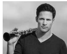
Andreas Ottensamer