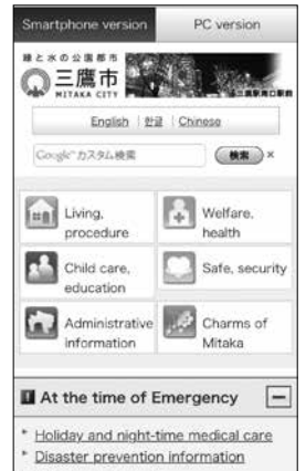
The service can also be used on the smartphone version

Inquiries: Secretariat and Public Relations Section, Ext. 2134