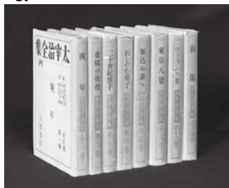
Collected Works of Osamu Dazai , Yakumo Shoten, 1948-49; owned by Mitaka City

Location: Osamu Dazai Literature Salon (Gran Jardin Mitaka 1F, 3-16-14 Shimorenjaku)