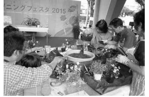
Gardening class at last year's festival

Inquiries: NPO Flowers and Greenery Town Mitaka Creation Association, Tel: 0422-31-2671 (until Aug. 25), 0422-46-2081 (from Aug. 26)