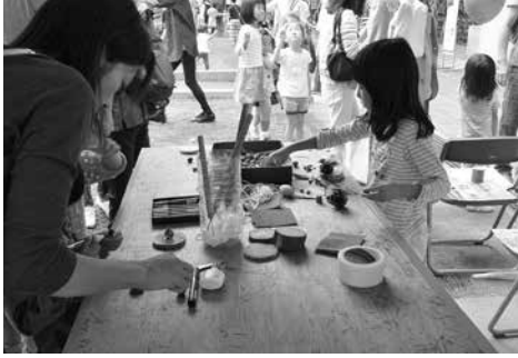
Woodcraft booth at last year's festival

The goal of Gardening Festa, a festival of flowers and greenery, is to encourage greenification activities among city residents. We have prepared many events related to flowers and greenery that everyone from children to adults can enjoy.