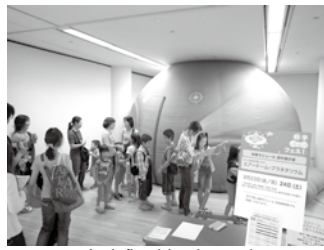
An inflatable planetarium