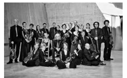
Freiburger Barockorchester

U-23 (those 23 years of age or under): ¥3,500