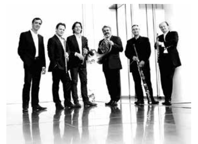
Les Vents Francais

U-23 (those 23 years of age or under): ¥3,500