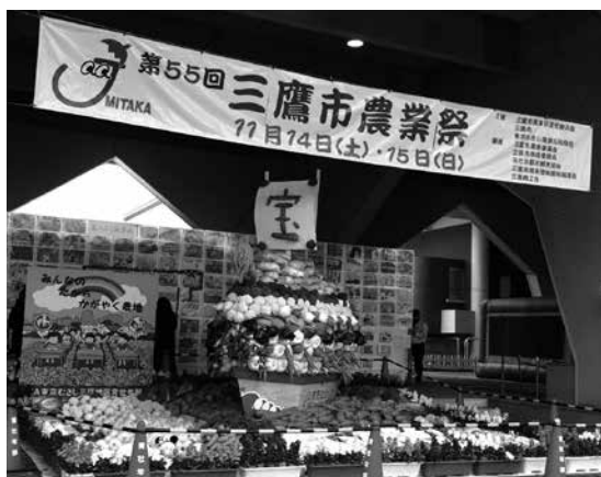
Last year's treasure ship made of Mitaka City vegetables

Distribution of vegetables: November 13, from 2:30 p.m. (subject to change)