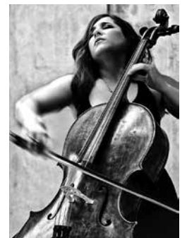
Alisa Weilerstein

J. S. Bach: Cello Suite No. 1 in G major BWV1007; Suite No. 3 in C major BWV1009; Suite No. 5 in C minor BWV1011