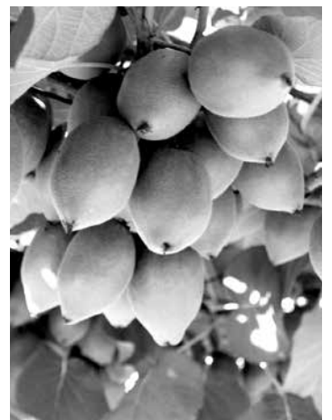
Kiwifruit waiting to be harvested