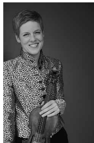
Isabelle Faust

Note: There is no intermission for each part. In some cases, admission may not be permitted during the performance.