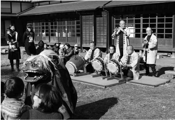
Shishi-mai lion dance and iwai-bayashi music

Inquiries: Mitaka Picture Book House in the Astronomical Observatory Forest, Tel: 0422-39-3401, closed from December 27 (Tue.) to January 4 (Wed.).