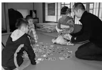
Astro Karuta card tournament

Application: Come to the venue directly on the day of the event for both events