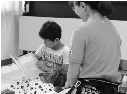
Scene from the last event

Inquiries: Mitaka Library, Tel: 0422-43-9151