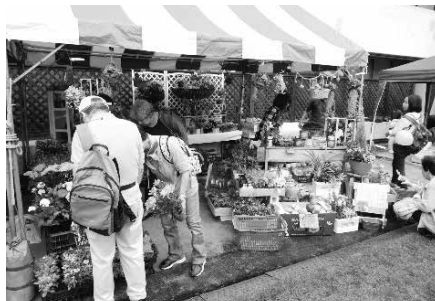
Scene from last year's festival