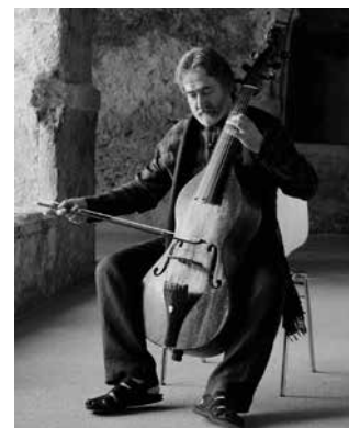
Jordi Savall

Tickets now on sale. All seats reserved.