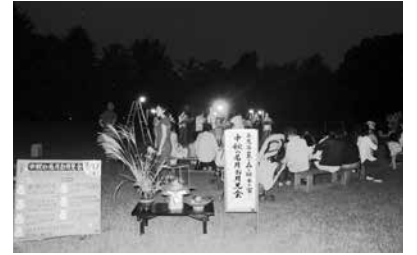
Scene from last year

Inquiries: Mitaka Picture Book House in the Astronomical Observatory Forest, Tel: 0422-39-3401, URL: http://www.city.mitaka.tokyo.jp/ehon/