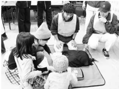
Emergency first aid drills using an AED

Ride on an earthquake-demonstration vehicle and learn how to protect yourself at home.