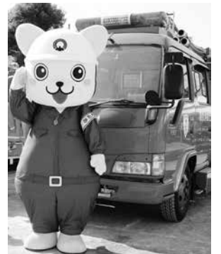
Mitaka City's popular disaster prevention mascot Jijomaru will participate in the drills again this year.

Roll the dice, complete the task noted on the spot where you land, and aim for the finish line!