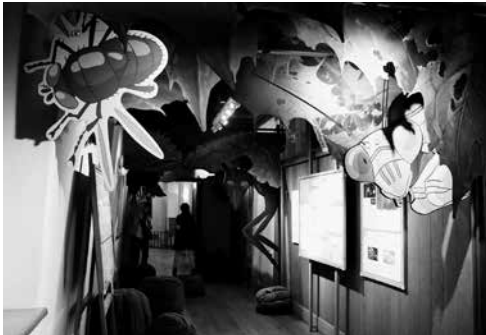
© Museo d'Arte Ghibli ©2018 Studio Ghibli

The Ghibli Museum is showing the short anime film Boro the Caterpillar until Friday, August 31 at the Saturn Theater room. An exhibition related to Boro is being shown at the gallery on the second floor in conjunction with the film (pictured on right). Enjoy seeing the world through a bug's eyes as depicted by director Hayao Miyazaki.