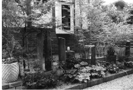
An entry from last year's "My Garden" category

Gardens and other areas rich in vivid seasonal colors and greenery that face the street are eligible. Please introduce a flowerbed around your home, school or company (in Mitaka City only).