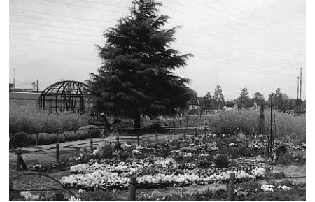
An entry from last year's "My Favorite Green Spot" category

Please introduce your favorite scenery in Mitaka City. This can be vivid flowers and greenery or trees, your favorite green oases and other areas in your neighborhood that residents can see and that you would like to preserve for future generations.