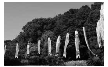
A scene from last year's Osawa-no-Sato event

Inquiries: Mitaka Town Management Organization, Tel: 0422-40-9669