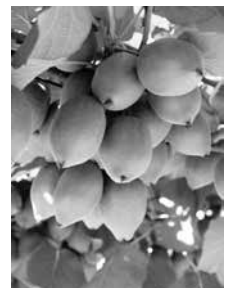
Kiwifruit waiting to be harvested

There are many other events to enjoy. For more information, please visit the Mitaka City website.