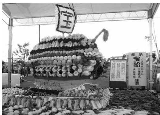
Last year's treasure ship made of Mitaka City vegetables

Distribution of vegetables: November 11, from 2:30 p.m. (subject to change)